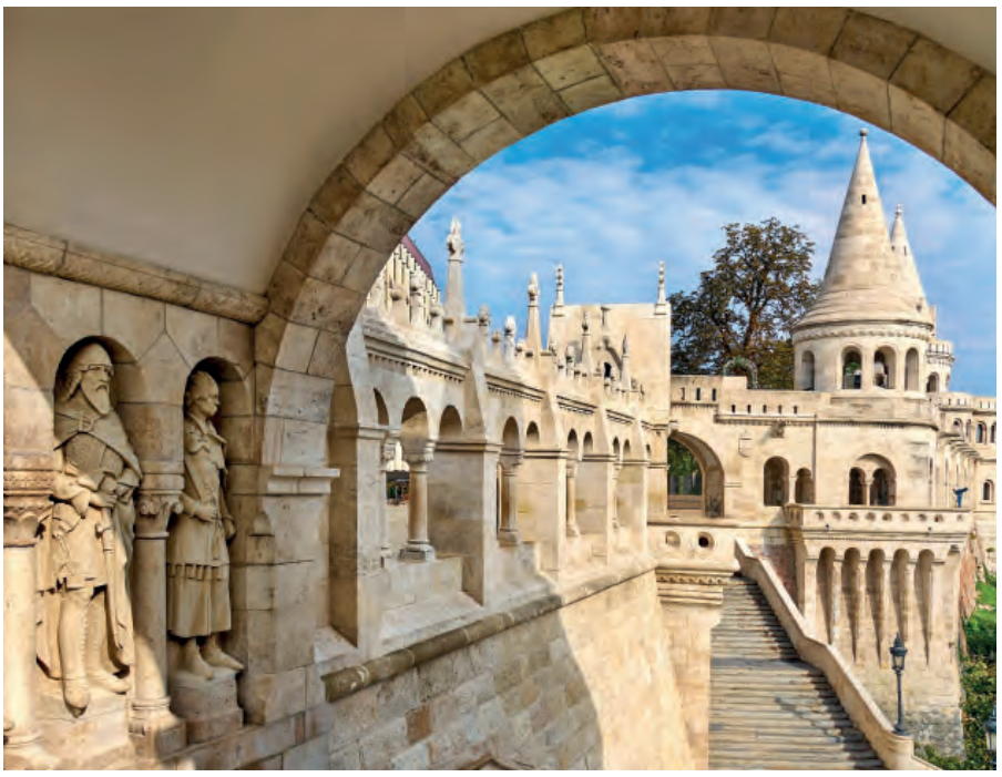
Fishermen's Bastion, Budapest

Enjoy two full days in Budapest exploring the tree-lined boulevards of Pest and the cobbled hilly streets of Buda.