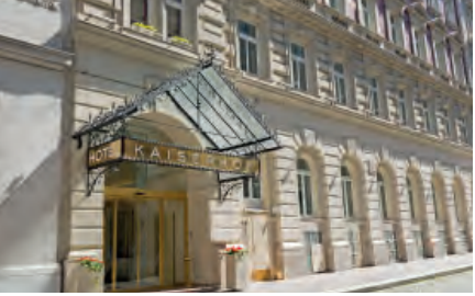
Hotel Kaiserhof, Vienna

Hotel Torbrau is a family-owned hotel superbly situated at the gateway to Munich's Old Town. Rooms are comfortable, and the hotel offers a restaurant and restored wine cellar.