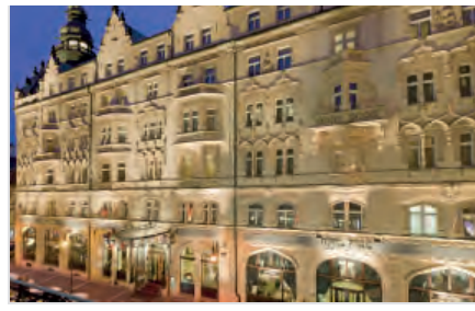
Hotel Paris, Prague