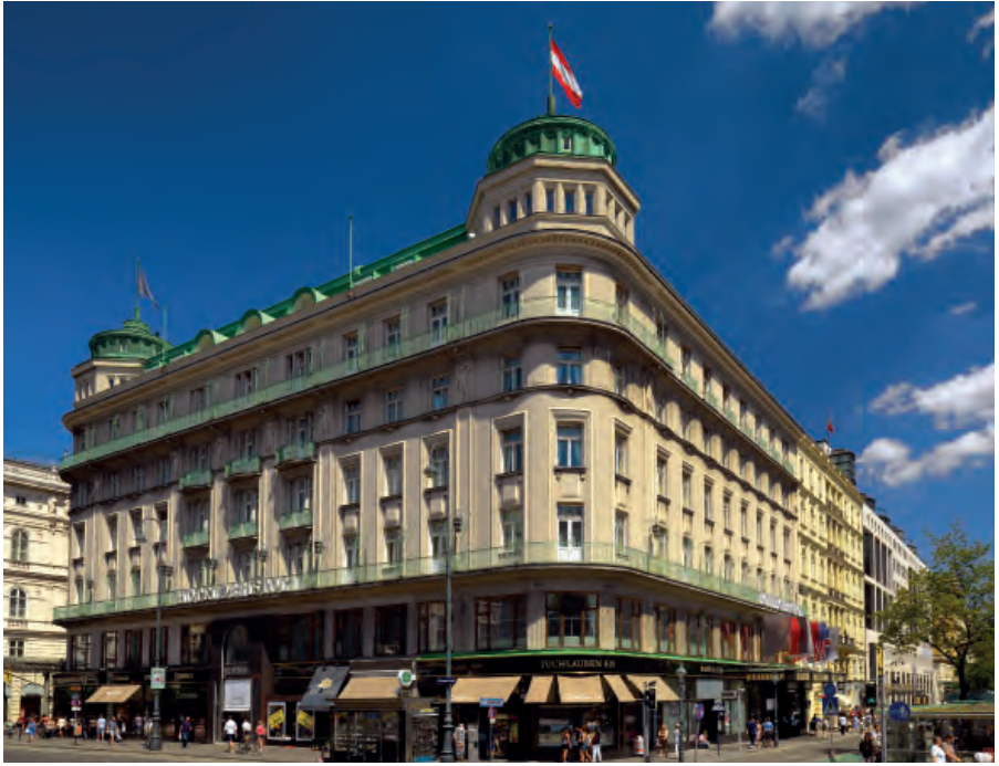
Hotel Bristol, Vienna

Prestige Hotel is located on a quiet side-street close to Chain Bridge and Parliament. Enjoy the Michelin starred restaurant which has a friendly bistro feel. The 85 rooms are vintage