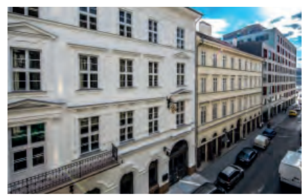
Hotel Prestige, Budapest